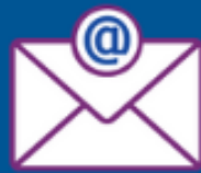
Email Joint Finance Committee