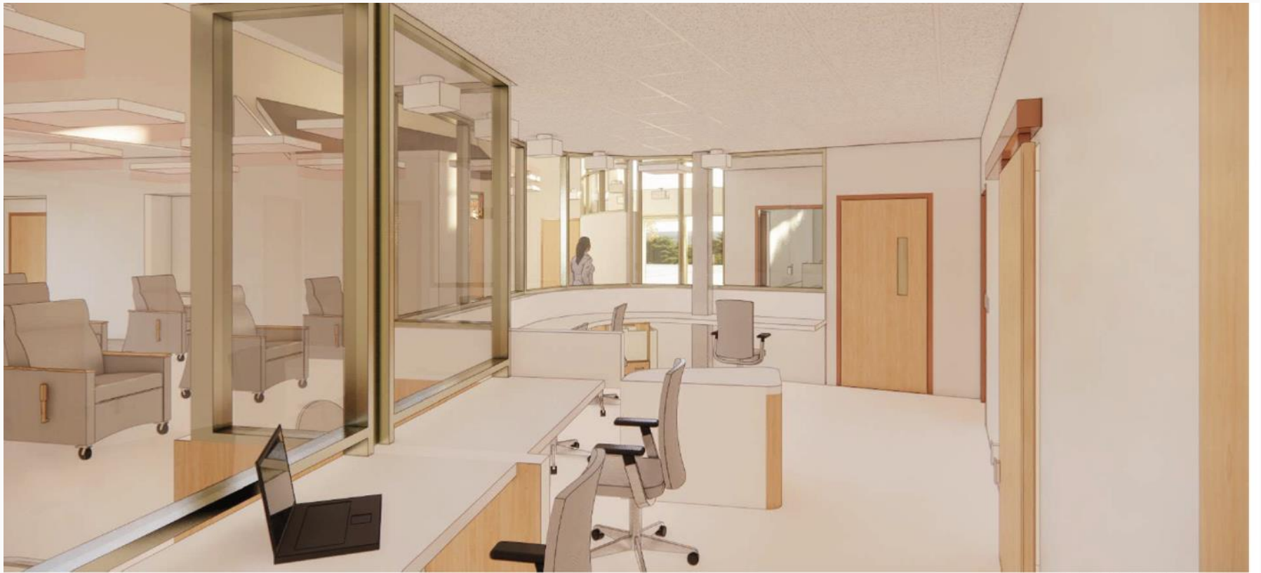
VIEW FROM TEAM WORK DESK