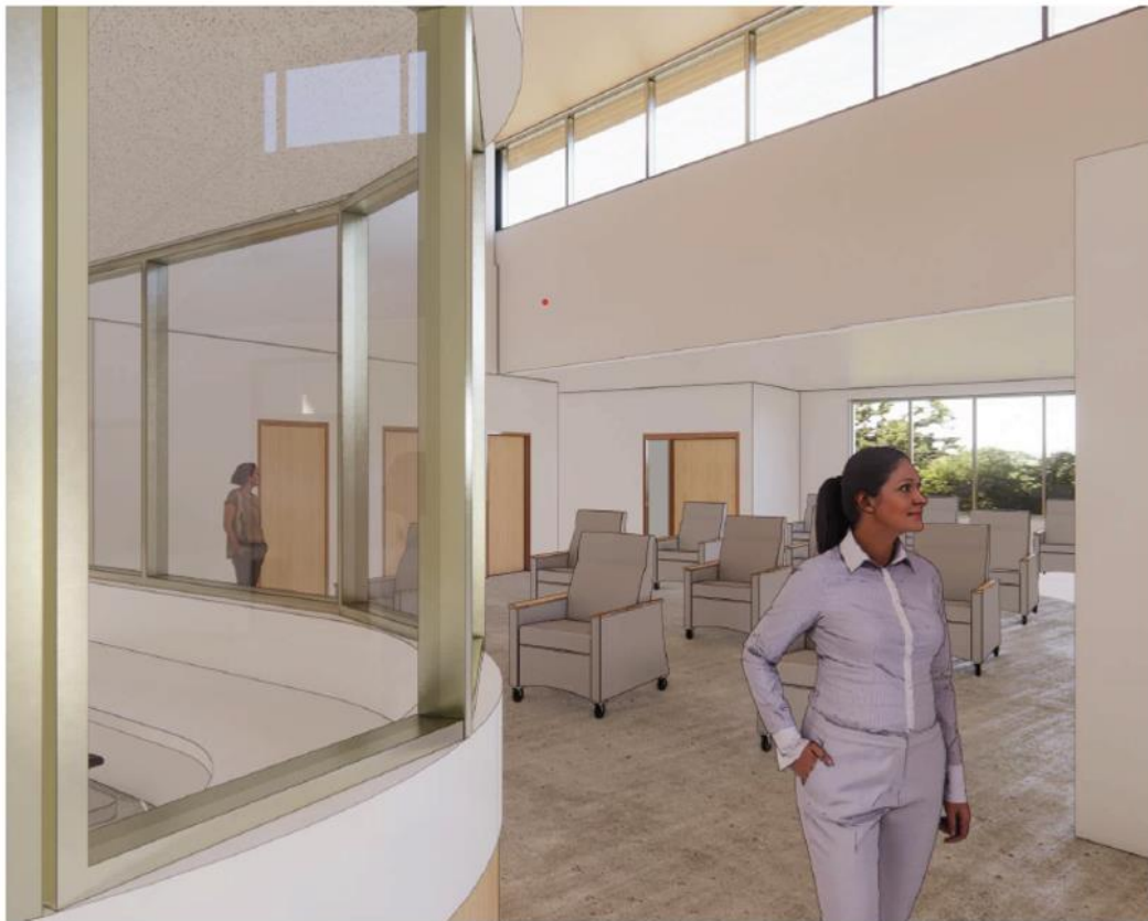
ADULT MILIEU FROM ENTRY