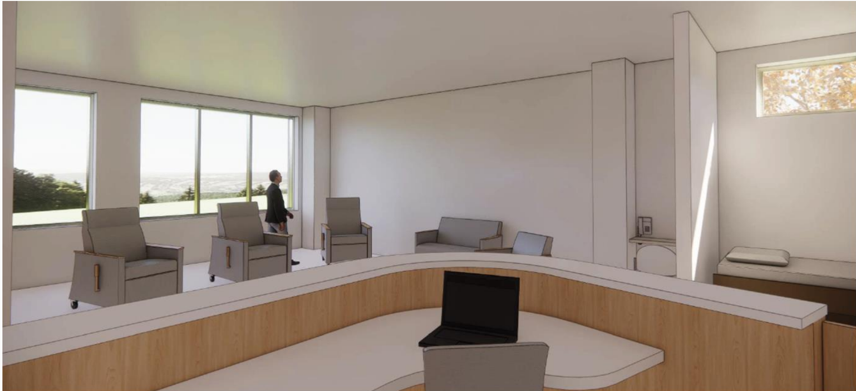
ADOLESCENT MILIEU FROM WORK STATION