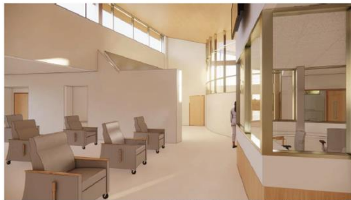
FAMILY AREA AND ADOLESCENT ENTRY FROM BOOTH