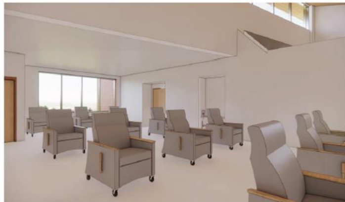
ADULT MILIEU FROM INTERVIEW BOOTH