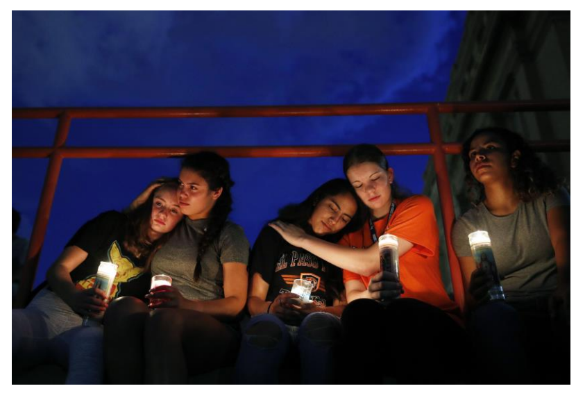
El Paso, TX